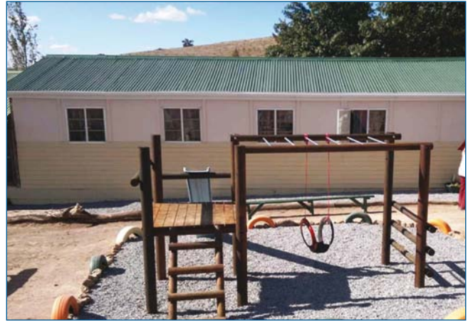
The Mooiplaas Community Centre before and after the make-over co-ordinated by Newkidz on the Block.